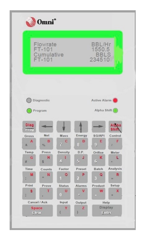
NEW REV G 6002 FRONT PANEL